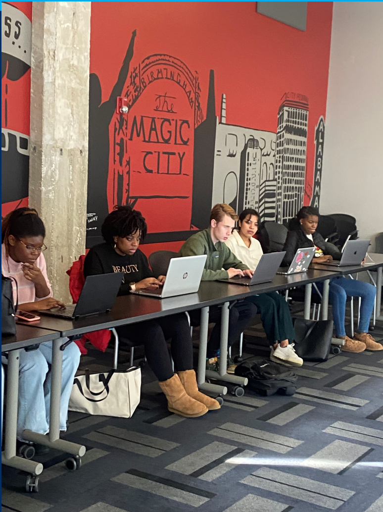
STUDENTS FROM THE STREAM CAMP WITH i3 ACADEMY

*the grant recipient preferred to keep their name private, so the name ‘Kelsey’ was used as a pseudonym.